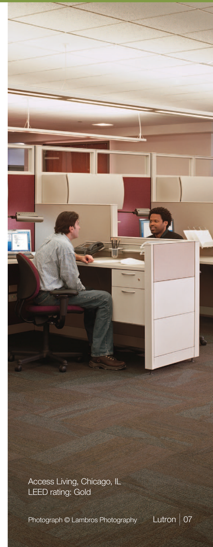
Access Living, Chicago, IL LEED rating: Gold

Lutron Greenovation® provides state-of-the-art classroom lighting with state-correlated energy lessons 3