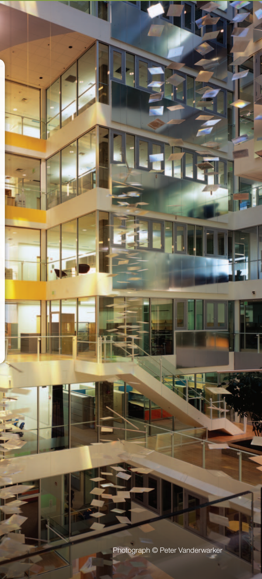
Genzyme Center, Cambridge, MA LEED rating: Platinum

Lutron is a national member of the United States Green Building Council and a sponsor of Delaware Valley Green Building Council.